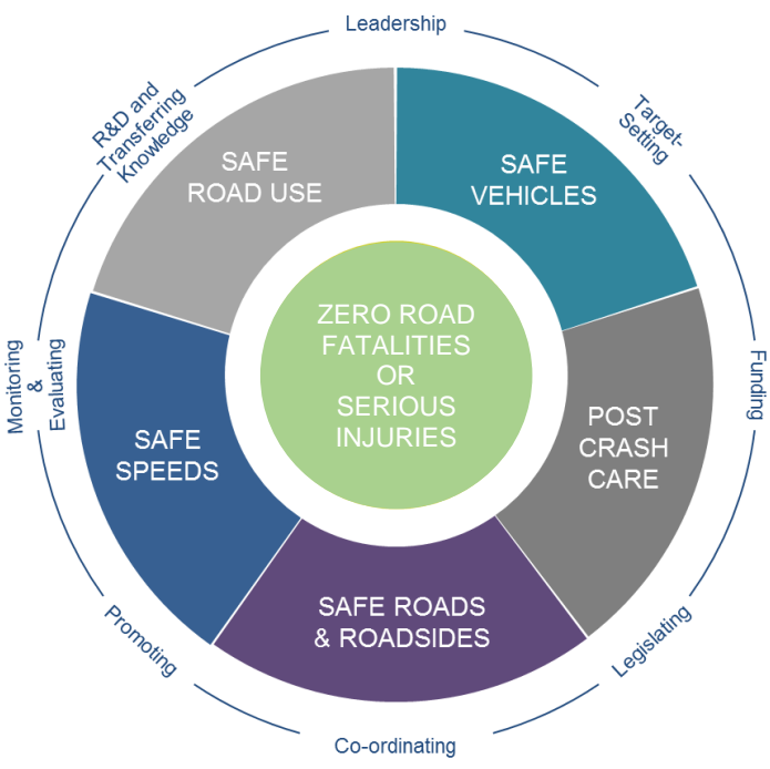
Figure 1: Safe System Approach to Road Safety

vehicle, user, speed, medical care) to eliminate serious injuries (even though crashes may still occur) by controlling the energy impact on the human body when a crash occurs.<sup>2</sup>