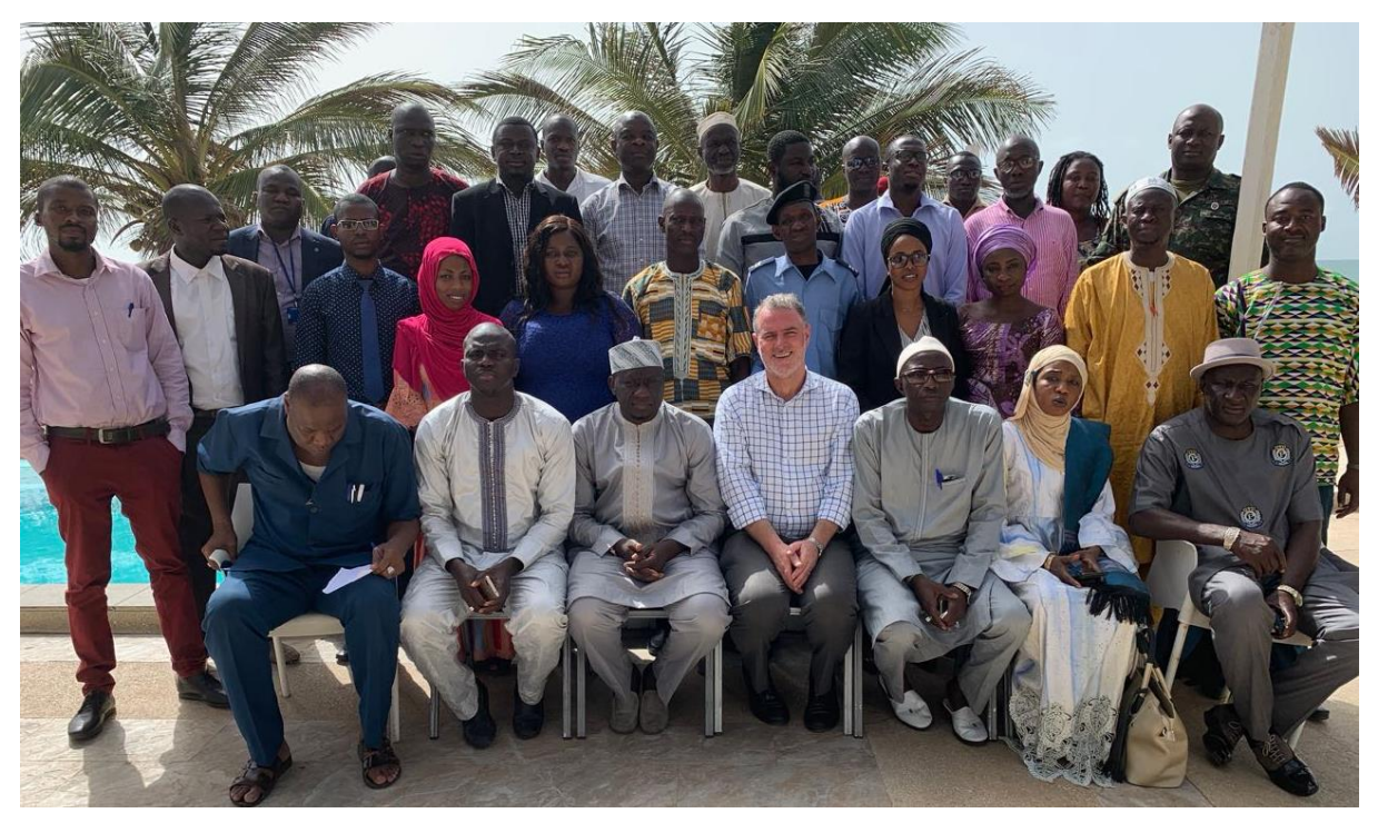
Stakeholder Workshop, July 2019